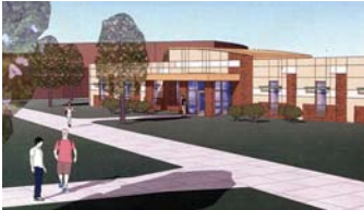
Groundbreaking for Columbus residence hall, page 2.

CCC is now on Facebook. Become a fan and keep up on what's happening at the college.