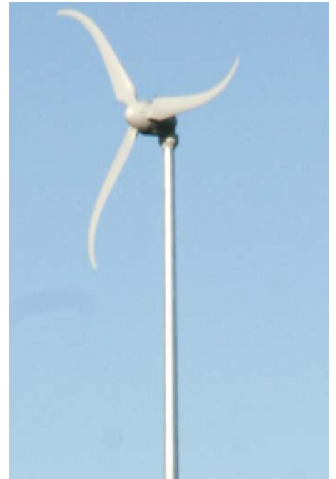
This 1.7 kilowatt wind turbine on the Hastings Campus will help students learn about alternate energy sources.