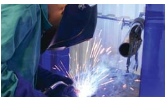
Grand Island Industrial Academy ribbon-cutting, page 5.